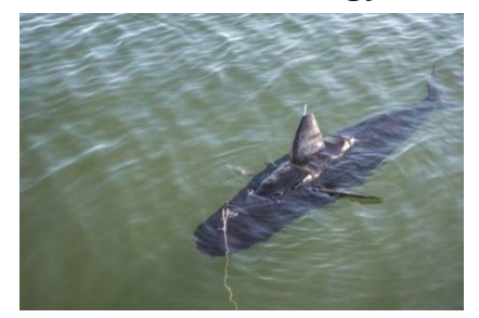
Shark Drone

http://www.pixable.com/article/u-s-navy-completestesting-on-ghostswimmer-an-underwater-sharkdrone-ghostswimmer-13698?utm_medium=viral&utm_source=email&track src=SHEMMOB19